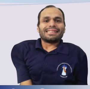
By: JOHN CABRERA Client Advocate

Proclaimed by the United Nations in 1992 "International Day of People with Disabilities" and later changed in 2008 to "International Day of Persons with Disabilities" (IDPwD) is annually held on December 3rd. It is a day dedicated to raise awareness and recognize the experiences of people with disabilities for their individuality, contributions and rights around the world. The day involves all people with physical and/or intellectual disabilities. The day consists of informative events and/or functions that bring attention to the challenges they face to be included in all aspects of life,